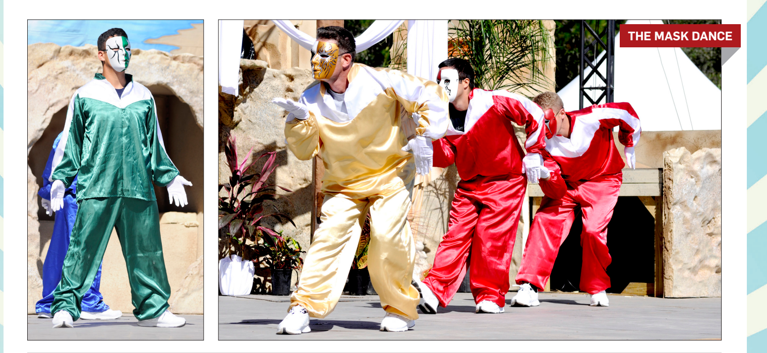
FROM THE PLAY "NOTHING IS IMPOSSIBLE FOR GOD"